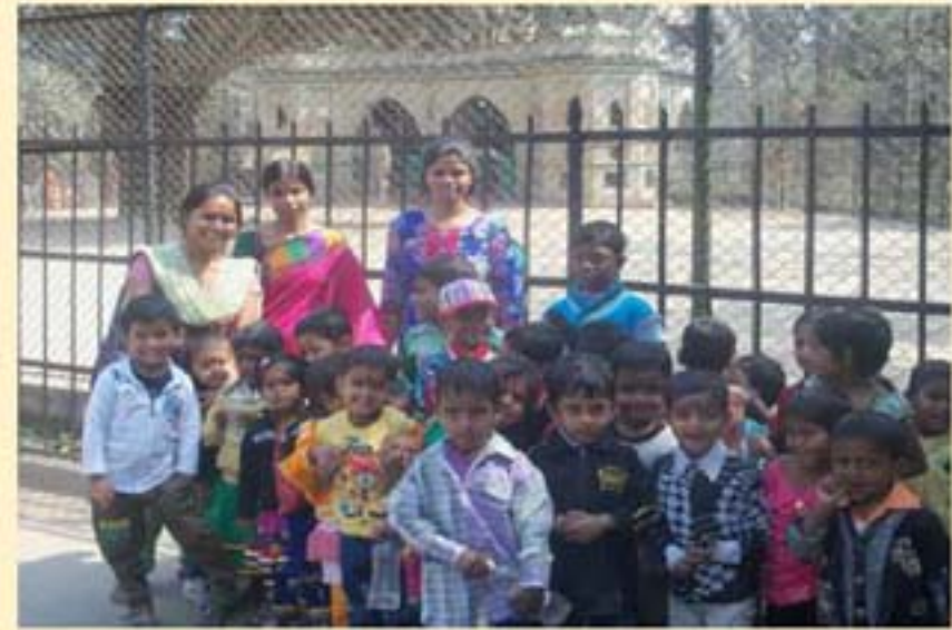
Outing to Zoological Gardens

On 18 th February, 2014, children were taken for an Outing to the Zoological Gardens . As always, children really enjoyed seeing the different animals and had a fun time at the Zoo.