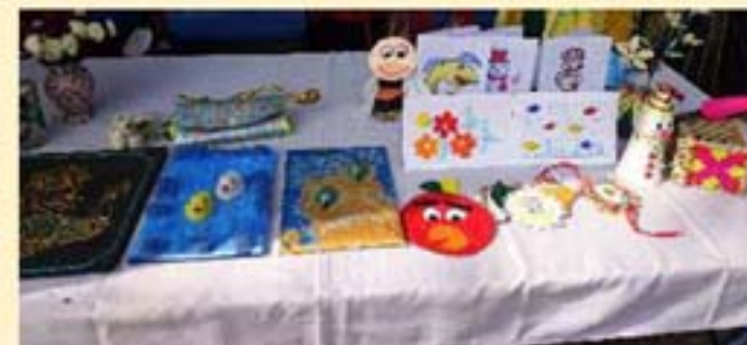
Some VTC Products