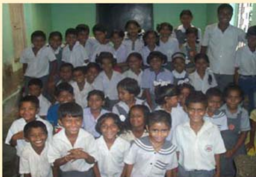
Swami Vivekananda Vidyamandir, Dum Dum