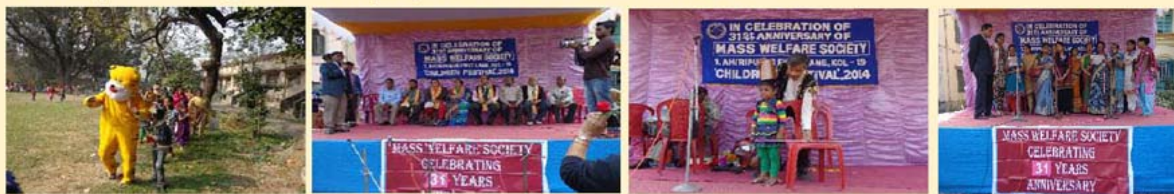
Children's Festival at Bishop's College to Commemorate 31 st Anniversary of MWS

On 11 th January 2014, Children's Festival to commemorate the 31 st Anniversary of Mass Welfare Society was held at Bishop's College, Kolkata. About 800 children participated. There were many splendid performances of songs, dance, drama and elocution by the students of the different centres. For the entertainment, there was a Magic Show, several jokers in costumes, and various games. Eminent social workers and leaders attended this programme and delivered their speeches. Parents of our students and many people from the local community also attended the programme. Food packets were provided to all children. A Handicrafts Stall of our Women's Development Programme displayed several hand-made articles.