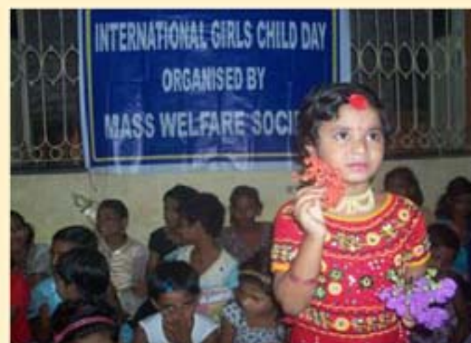
International Girl Child Day

On 9 th September, International Literacy Day was observed at all the centres. (8 th September was a Sunday, so it was celebrated on Monday, the 9 th ). Resource persons stressed upon the importance of education and its advantages in their speeches.