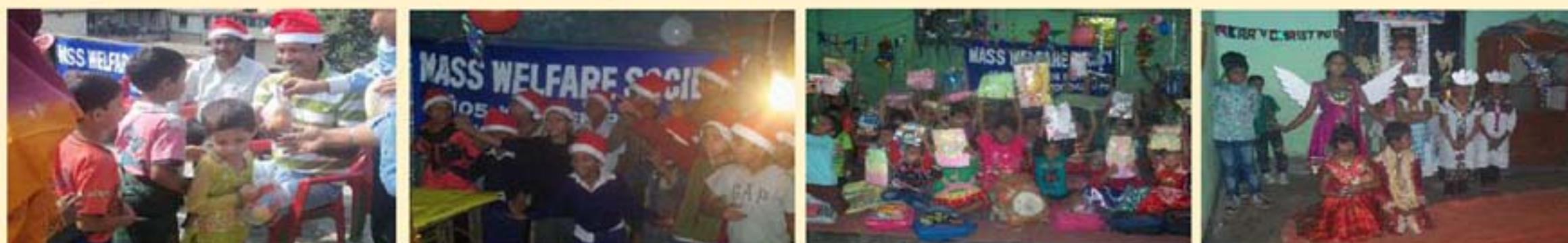
Christmas Celebrations at Various Centres

In the month of December 2013, Christmas Programme was celebrated on different days at different centres. In this programme Children and their parents enjoyed very much. The birth of Jesus Christ was played by the children; they sang different Christmas songs and after the programme, all children given food packets and clothes.