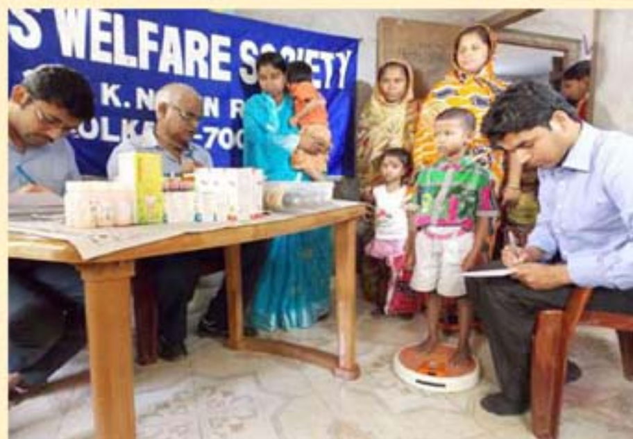
Height & Weight Measurement

The effectiveness of the Health Programme is evident from the positive feedback from needy children, who are the prime beneficiaries and also their parents and many other community people.