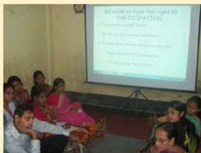
Training on 'Trafficking'

On 24 th September, International Girl Child Day was celebrated in all the centres. The girls of the centres presented beautiful dances and songs. They were also told, according to their level, about the need for the empowerment of girls and women. At the end of the programme, food packets were given to all the girls.