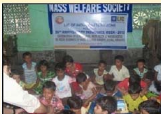
International Literacy Day

On 5 th September, Teacher's Day was celebrated in all the centres. Children presented flowers and gifts to the teachers of their respective centres to show their respect and love for them.