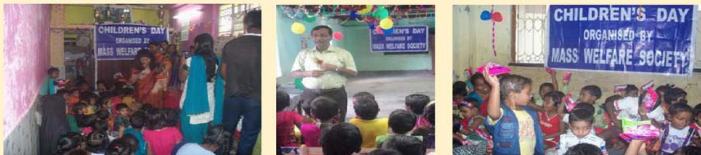
Children's Day Celebrations at Various Centres

On 14 th November 2013 Children's Day was celebrated in the centres of MWS. Children sang songs, gave dance performances and recited poetry. All children were given sweets and fruits.