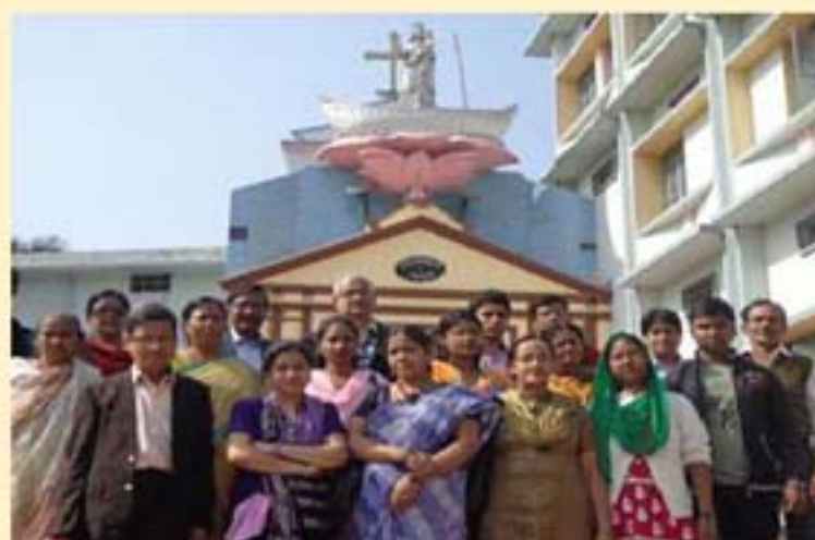
Staff Picnic at Bandel

On 23 rd January, 2014, a Picnic was organized for all staff at Bandel Church.