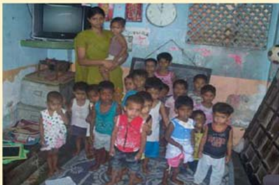
Mitra Sangha, Peyarabagan

The Education Programme was run successfully in 10 preparatory schools and 4 evening tutorial centers which are located in 5 slum areas namely Beckbagan, Peyarabagan (Bhowanipur), Topsia, Matangini Pally and Panchannagram on the Eastern Metropolitan Bypass and Dhamua a remote village close to Diamond Harbour in the South 24 Paraganas.