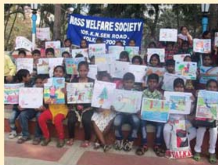
Sit & Draw Competition

On 28 th January, 2014, a Sit & Draw Competition for the children of the different centres was organized at Millennium Park. The children were divided into 3 groups according to age. For each group, there was a 1 st , 2 nd & 3 rd Prize. Apart from this, consolation prizes were also given. Food Packets were provided to all children.