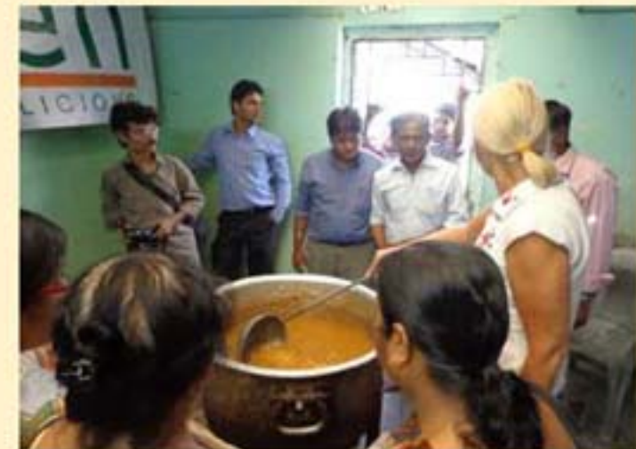
Fedwell Soup Making Demo