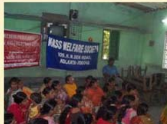
Awareness Programme on Women & Child Trafficking

A Handbook entitled "Manab Pacharer Birudhdhe Amra Lorbo" (We will fight against Human Trafficking) was printed and distributed among the mothers of the children in all the centres. The handbook contains statistics about Trafficking and Violence Against Women in West Bengal, existing laws, relevant IPC Sections, some Do's and Don'ts and the contact numbers and contact persons of the Women's Grievance Cell and Anti-Trafficking Departments at Kolkata Police Headquarters, Lalbazar and other like-minded NGOs who worked on the issues of trafficking and violence against women.