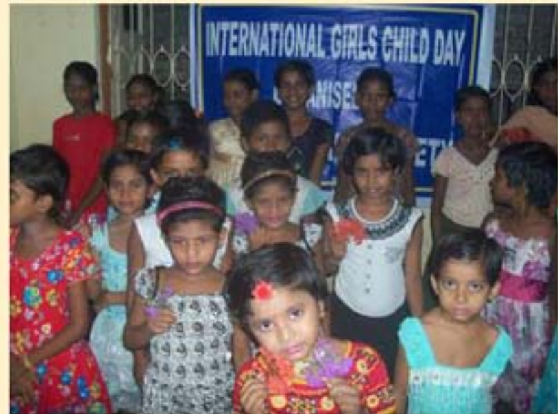
International Girl Child Day