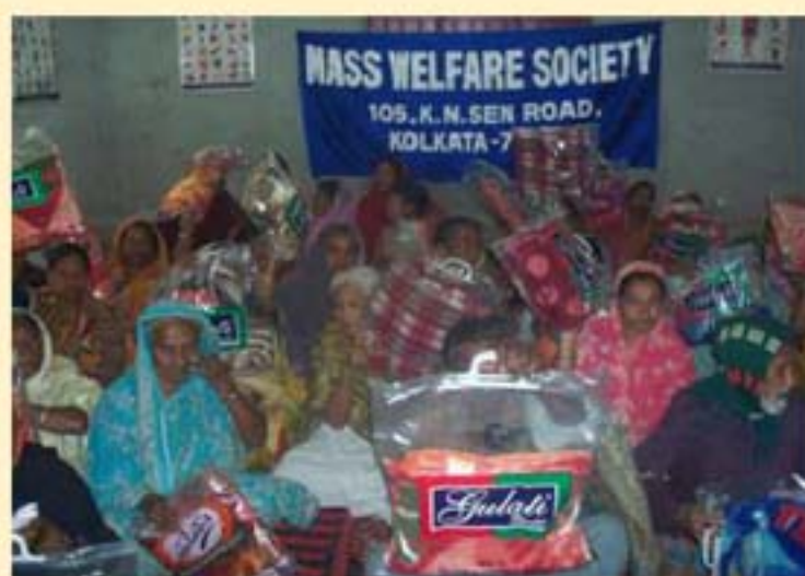
Blanket Distribution at Dhamua

On 29 th January, 2014, warm blankets were distributed to the elderly and needy people of Dhamua.