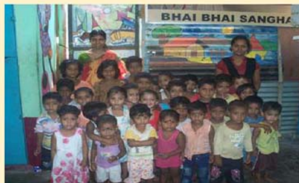
Bhai Bhai Sangha, Peyarabagan