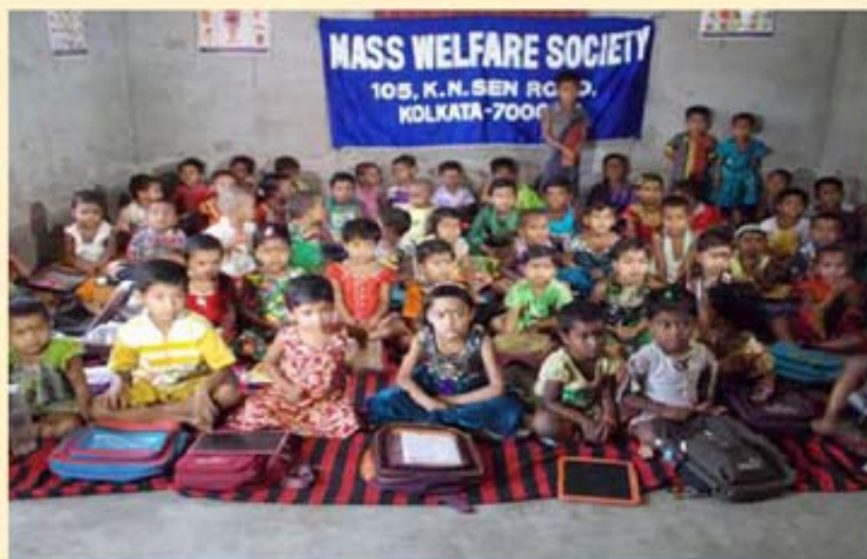
Little Flower School, Dhamua,

Both the Prep Schools and Tutorial Centres were operational 5 days a week (Monday Friday). The timings of the Prep Schools is normally from 9:00 a.m. 1:00 p.m. and that of the Coaching Centres between 5:30 p.m. 7:30 p.m.