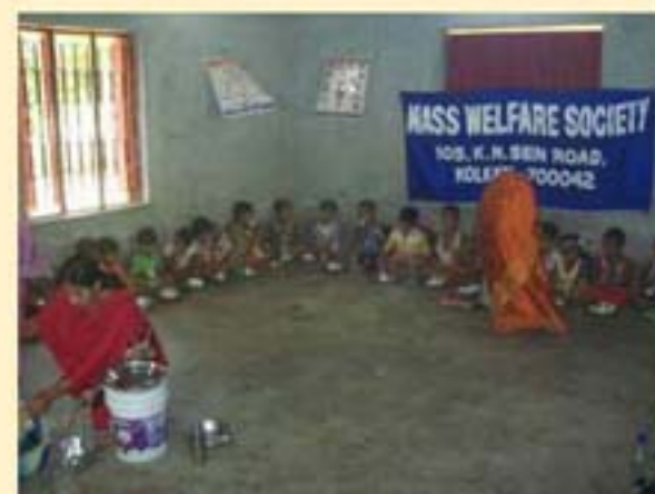
Lunch at Dhamua

All the children were provided with allied educational materials such as- pencils, exercise copies, books, slates etc.