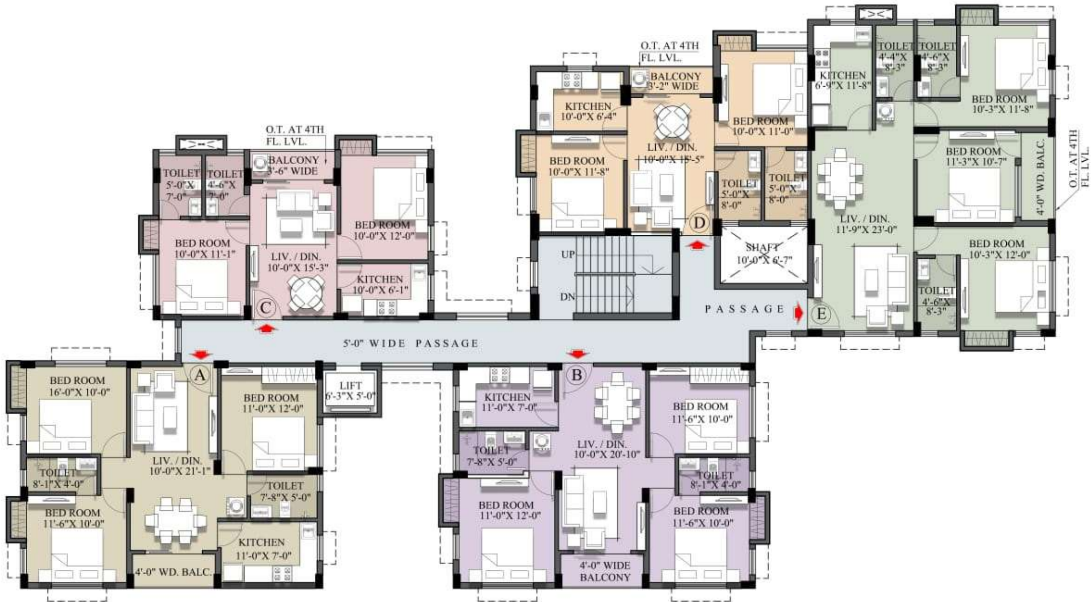
1ST TO 4TH FLOOR PLAN (TYPICAL) BLOCK - B

PROPOSED G+IV STORIED RESIDENTIAL BUILDING AT PREMISES NO. 128, PRANTIK PALLY, KOLKATA.