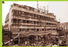
KOLEY MARKET (Bowbazar)

With strong financial background, the company stands on the threshold of quality construction, distinct features, time bound delivery, reasonable pricing and full satisfaction to buyer.