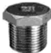
HEX HEAD PLUG