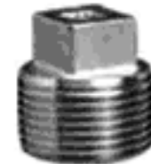
SQ HEAD PLUG