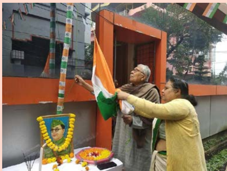
Netaji's Birth Anniversary